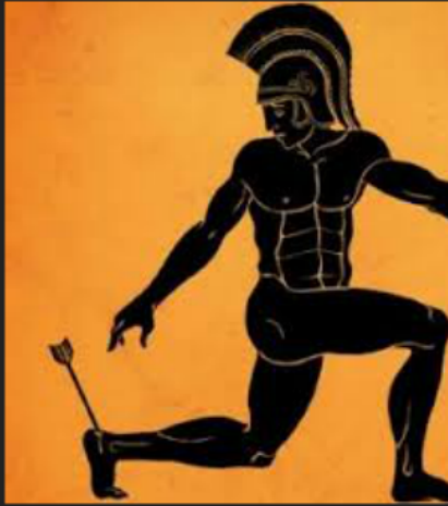
Achilles Heel: The danger of pride