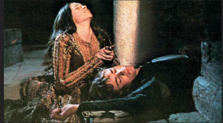
Romeo and Juliet: The danger of wrath

We tell them to everyone, in order that some may escape the predictable failures of humanity.